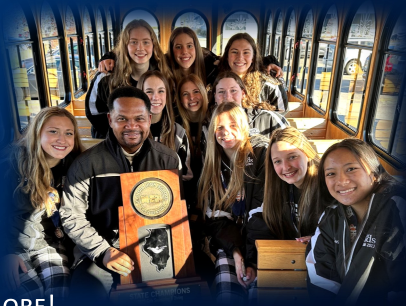
▲ The Rosary Beads Swim Team are the 2023 IHSA State Champions. This is their eighth time achieving this distinction.