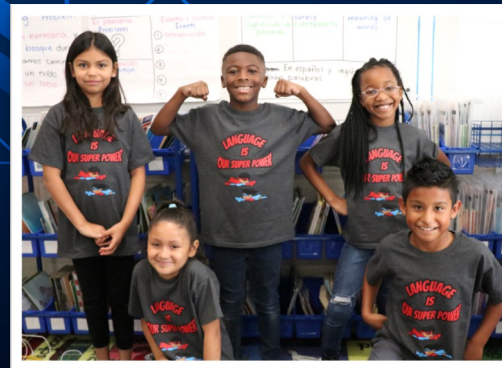
East Aurora School District 131 has received national recognition for its district-wide dual language program!

The Aurora STEAM Academy, supported by the City, provided free STEAM education to more than 3,000 students!