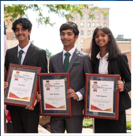
Indian Prairie School District 204 students won the National eCyberMission STEM competition for the second consecutive year!

IMSA is ranked the #1 college preparatory public high school in Illinois and #1 STEM high school in Illinois!